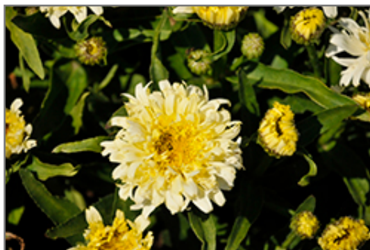
Ice Cream Dream Shasta Daisy flowers