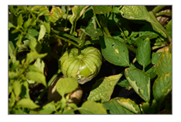
Tamayo Tomatillo fruit