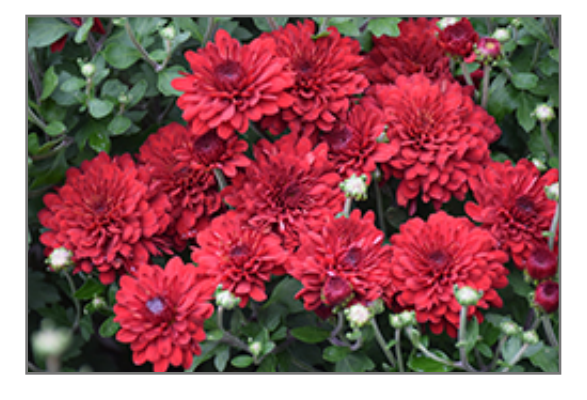
Radiant Red Chrysanthemum flowers