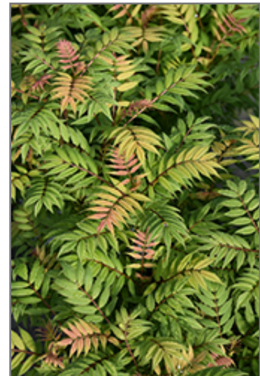
Mr. Mustard False Spirea foliage