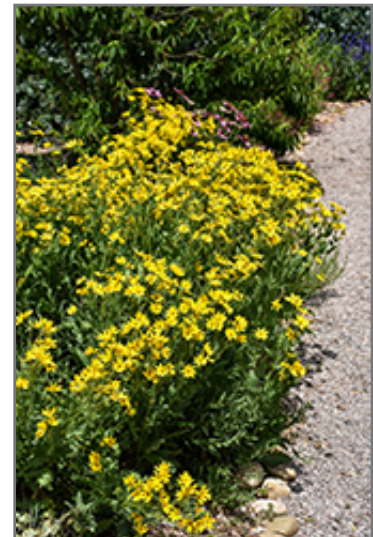
Engelmann's Daisy in bloom