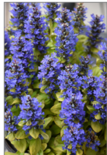
Feathered Friends Petite Parakeet Bugleweed flowers