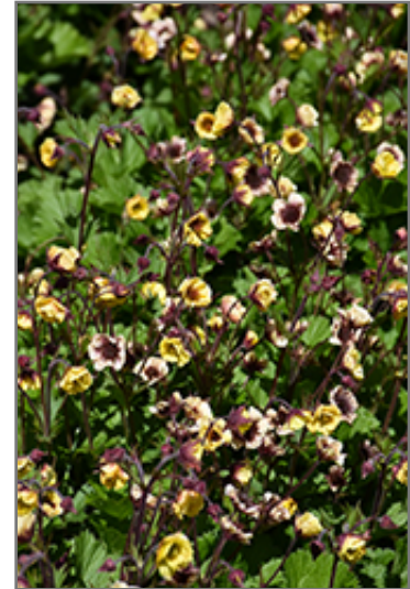
Tempo Yellow Avens flowers

Tempo Yellow Avens is recommended for the following landscape applications;