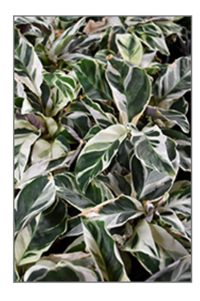
White Fusion Calathea foliage

When grown indoors, White Fusion Calathea can be expected to grow to be about 24 inches tall at maturity, with a spread of 24 inches. It grows at a slow rate, and under ideal conditions can be expected to live for approximately 5 years. This houseplant should only be grown away from direct sunlight or in a room with strong artificial light. It does best in average to evenly moist soil, but will not tolerate standing water. The surface of the soil shouldn't be allowed to dry out completely, and so you should expect to water this plant once and possibly even twice each week. Be aware that your particular watering schedule may vary depending on its location in the room, the pot size, plant size and other conditions; if in doubt, ask one of our experts in the store for advice. It will benefit from a regular feeding with a general-purpose fertilizer with every second or third watering. It is not particular as to soil pH, but grows best in rich soil. Contact the store for specific recommendations on pre-mixed potting soil for this plant.