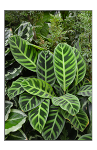
Zebra Plant foliage

When grown indoors, Zebra Plant can be expected to grow to be about 3 feet tall at maturity, with a spread of 24 inches. It grows at a slow rate, and under ideal conditions can be expected to live for approximately 5 years. This houseplant should only be grown away from direct sunlight or in a room with strong artificial light. It does best in average to evenly moist soil, but will not tolerate standing water. The surface of the soil shouldn't be allowed to dry out completely, and so you should expect to water this plant once and possibly even twice each week. Be aware that your particular watering schedule may vary depending on its location in the room, the pot size, plant size and other conditions; if in doubt, ask one of our experts in the store for advice. It will benefit from a regular feeding with a general-purpose fertilizer with every second or third watering. It is not particular as to soil pH, but grows best in rich soil. Contact the store for specific recommendations on pre-mixed potting soil for this plant.