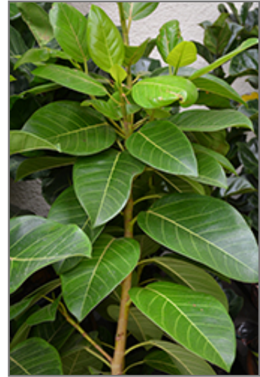
Council Tree in full

When grown indoors, Council Tree can be expected to grow to be about 7 feet tall at maturity, with a spread of 4 feet. It grows at a medium rate, and under ideal conditions can be expected to live for approximately 20 years. This houseplant will do well in a location that gets either direct or indirect sunlight, although it will usually require a more brightly-lit environment than what artificial indoor lighting alone can provide. It does best in average to evenly moist soil, but will not tolerate standing water. The surface of the soil shouldn't be allowed to dry out completely, and so you should expect to water this plant once and possibly even twice each week. Be aware that your particular watering schedule may vary depending on its location in the room, the pot size, plant size and other conditions; if in doubt, ask one of our experts in the store for advice. It will benefit from a regular feeding with a general-purpose fertilizer with every second or third watering. It is not particular as to soil type or pH; an average potting soil should work just fine. Be warned that parts of this plant are known to be toxic to humans and animals, so special care should be exercised if growing it around children and pets.