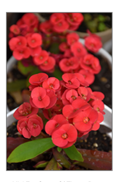
Mini Eos Crown Of Thorns flowers

When grown indoors, Mini Eos Crown Of Thorns can be expected to grow to be about 24 inches tall at maturity, with a spread of 24 inches. It grows at a slow rate, and under ideal conditions can be expected to live for approximately 20 years. This houseplant requires direct sun for optimal performance, and should therefore be situated in a room that gets bright sunlight for a good part of the day; it is not a good choice for rooms lit only by artificial light. It prefers dry to average moisture levels with very well-drained soil, and may die if left in standing water for any length of time. This plant should be watered when the surface of the soil gets dry, and will need watering approximately once each week. Be aware that your particular watering schedule may vary depending on its location in the room, the pot size, plant size and other conditions; if in doubt, ask one of our experts in the store for advice. It is not particular as to soil pH, but grows best in sandy soil. Contact the store for specific recommendations on pre-mixed potting soil for this plant. Be warned that parts of this plant are known to be toxic to humans and animals, so special care should be exercised if growing it around children and pets.