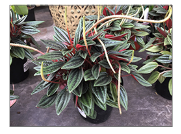
Rosso Peperomia in bloom