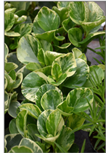
Golden Gate Baby Rubber Plant foliage

This is an herbaceous evergreen houseplant with an upright spreading habit of growth. This plant should not require much pruning, except when necessary to keep it looking its best.