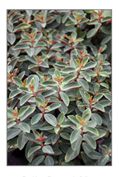
Red Log Peperomia foliage

When grown indoors, Red Log Peperomia can be expected to grow to be about 12 inches tall at maturity, with a spread of 18 inches. It grows at a slow rate, and under ideal conditions can be expected to live for approximately 5 years. This houseplant should only be grown away from direct sunlight or in a room with strong artificial light. It does best in average to evenly moist soil, but will not tolerate standing water. The surface of the soil shouldn't be allowed to dry out completely, and so you should expect to water this plant once and possibly even twice each week. Be aware that your particular watering schedule may vary depending on its location in the room, the pot size, plant size and other conditions; if in doubt, ask one of our experts in the store for advice. It will benefit from a regular feeding with a general-purpose fertilizer with every second or third watering. It is not particular as to soil type or pH; an average potting soil should work just fine.