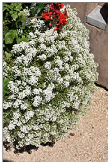
Easy Breezy White Lobularia flowers

Easy Breezy White Lobularia is recommended for the following landscape applications;