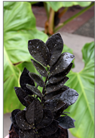
Raven ZZ Plant flowers