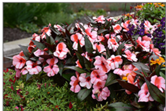
Clockwork Orange Stripe New Guinea Impatiens in bloom