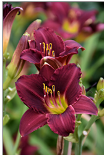
Ruby Stella Daylily flowers