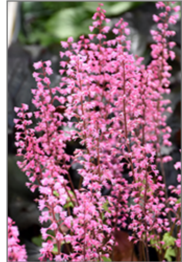
Dayglow Pink Foamy Bells flowers

Dayglow Pink Foamy Bells is a fine choice for the garden, but it is also a good selection for planting in outdoor pots and containers. It is often used as a 'filler' in the 'spiller-thriller-filler' container combination, providing a mass of flowers and foliage against which the larger thriller plants stand out. Note that when growing plants in outdoor containers and baskets, they may require more frequent waterings than they would in the yard or garden.