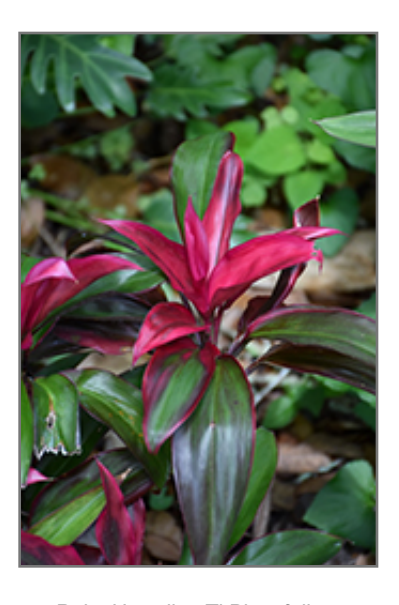
Ruby Hawaiian Ti Plant foliage

When grown indoors, Ruby Hawaiian Ti Plant can be expected to grow to be about 3 feet tall at maturity, with a spread of 24 inches. It grows at a medium rate, and under ideal conditions can be expected to live for approximately 10 years. This houseplant will do well in a location that gets either direct or indirect sunlight, although it will usually require a more brightly-lit environment than what artificial indoor lighting alone can provide. It does best in average to evenly moist soil, but will not tolerate standing water. The surface of the soil shouldn't be allowed to dry out completely, and so you should expect to water this plant once and possibly even twice each week. Be aware that your particular watering schedule may vary depending on its location in the room, the pot size, plant size and other conditions; if in doubt, ask one of our experts in the store for advice. It will benefit from a regular feeding with a general-purpose fertilizer with every second or third watering. It is not particular as to soil type or pH; an average potting soil should work just fine.