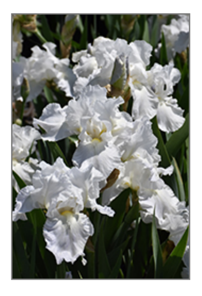
Immortality Iris flowers

Immortality Iris features bold white flag-like flowers with a buttery yellow beard at the ends of the stems in mid spring. The flowers are excellent for cutting. Its sword-like leaves remain green in color throughout the season.