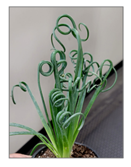
Frizzle Sizzle Albuca foliage