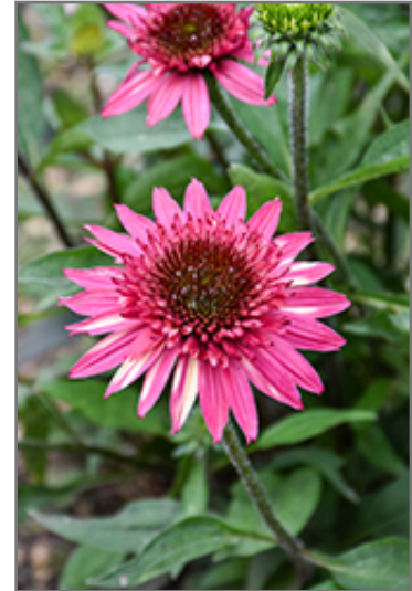
Giddy Pink Coneflower flowers

Giddy Pink Coneflower is recommended for the following landscape applications;