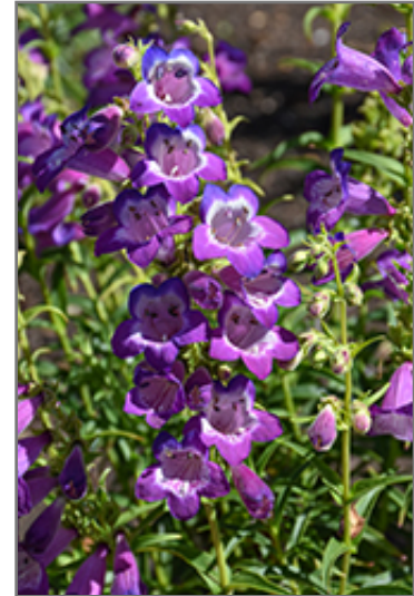
Cha Cha Purple Beard Tongue flowers

Cha Cha Purple Beard Tongue is recommended for the following landscape applications;