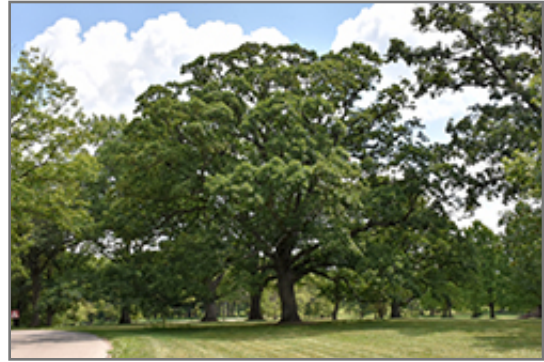
White Oak