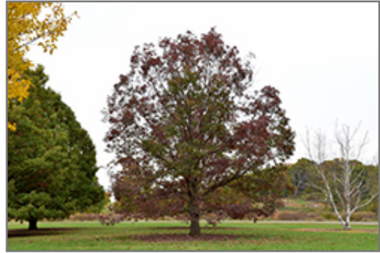
White Oak in fall

White Oak will grow to be about 90 feet tall at maturity, with a spread of 70 feet. It has a high canopy of foliage that sits well above the ground, and should not be planted underneath power lines. As it matures, the lower branches of this tree can be strategically removed to create a high enough canopy to support unobstructed human traffic underneath. It grows at a slow rate, and under ideal conditions can be expected to live to a ripe old age of 300 years or more; think of this as a heritage tree for future generations!