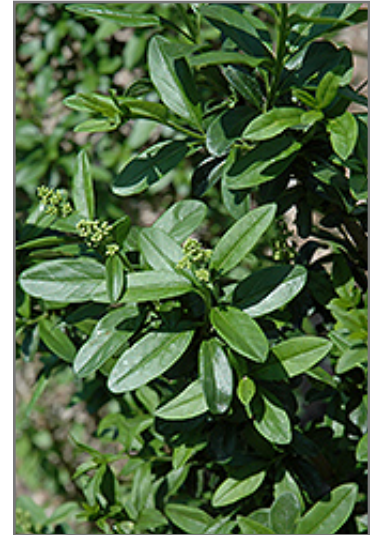
California Privet foliage