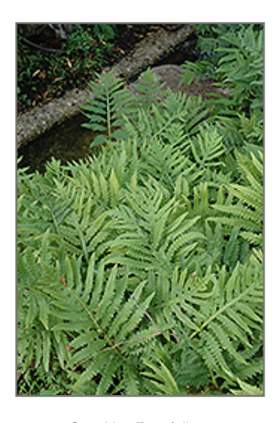
Sensitive Fern foliage