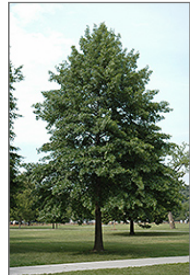
Pin Oak