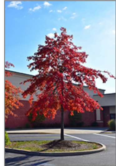
Pin Oak in fall