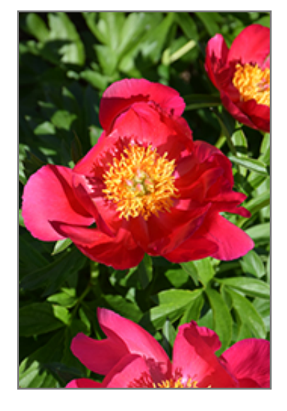
Scarlet O'Hara Peony flowers