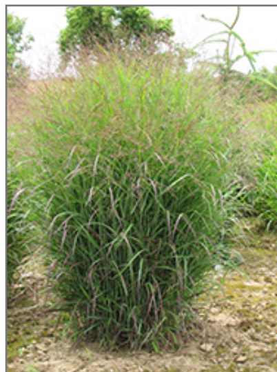
Prairie Sky Switch Grass

Prairie Sky Switch Grass features airy plumes of rose flowers rising above the foliage in mid summer. Its attractive grassy leaves are steel blue in color. As an added bonus, the foliage turns a gorgeous gold in the fall. The brick red seed heads are carried on showy plumes displayed in abundance from late summer to mid fall. The tan stems can be quite attractive.