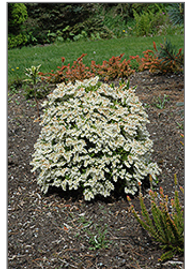
Prelude Japanese Pieris in bloom