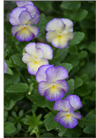
Etain Pansy flowers