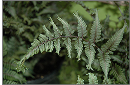
Applecourt Painted Fern foliage