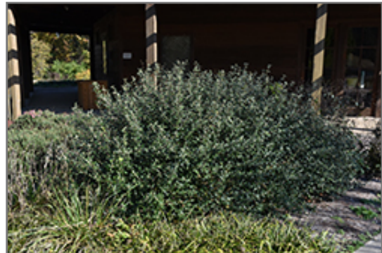
Prague Viburnum