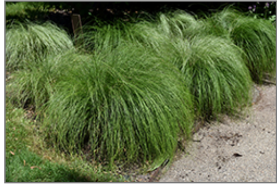
Silk Tassels Sedge