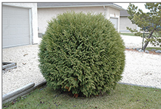
Woodwardii Arborvitae

Woodwardii Arborvitae will grow to be about 8 feet tall at maturity, with a spread of 8 feet. It tends to fill out right to the ground and therefore doesn't necessarily require facer plants in front, and is suitable for planting under power lines. It grows at a slow rate, and under ideal conditions can be expected to live for approximately 30 years.