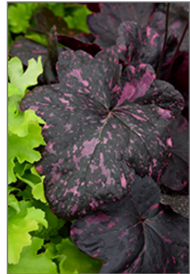
Midnight Rose Coral Bells foliage

Midnight Rose Coral Bells is recommended for the following landscape applications;