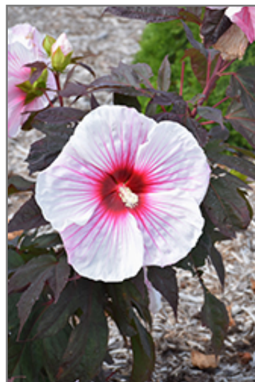
Kopper King Hibiscus flowers