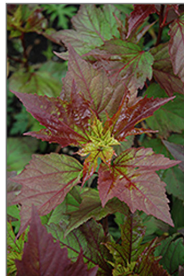
Kopper King Hibiscus foliage