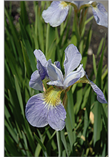
Sky Wings Siberian Iris flowers