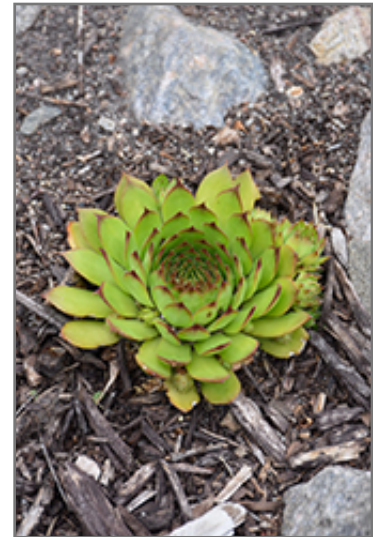
Sunset Hens And Chicks