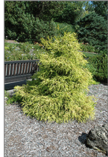
Lemon Thread Falsecypress

Lemon Thread Falsecypress is recommended for the following landscape applications;