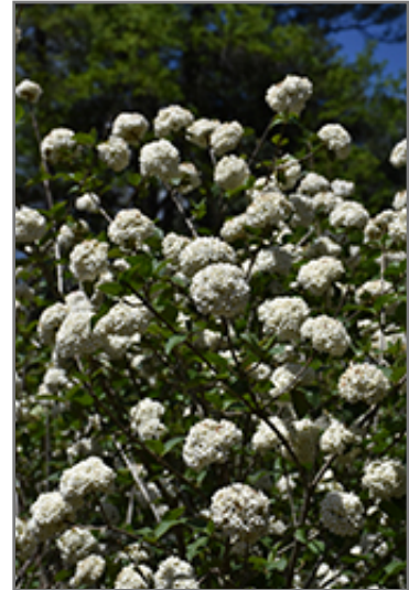
Fragrant Viburnum flowers

This shrub does best in full sun to partial shade. It prefers to grow in average to moist conditions, and shouldn't be allowed to dry out. It is not particular as to soil type or pH. It is highly tolerant of urban pollution and will even thrive in inner city environments. This particular variety is an interspecific hybrid.