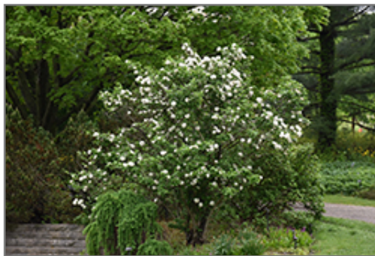
Fragrant Viburnum in bloom