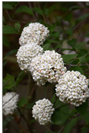
Fragrant Viburnum flowers

Fragrant Viburnum is recommended for the following landscape applications;