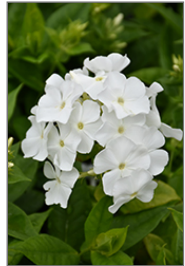
Flame White Garden Phlox flowers