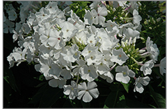
Flame White Garden Phlox flowers

Flame White Garden Phlox is recommended for the following landscape applications;