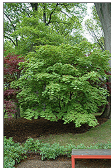
Cutleaf Fullmoon Maple