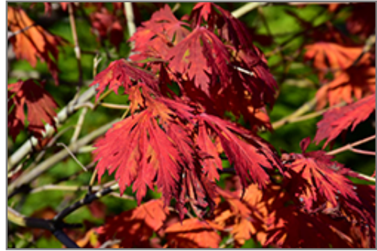
Cutleaf Fullmoon Maple in fall

This tree should only be grown in full sunlight, although you may want to keep it away from hot, dry locations that receive direct afternoon sun or which get reflected sunlight, such as against the south side of a white wall. It prefers to grow in average to moist conditions, and shouldn't be allowed to dry out. It is not particular as to soil type or pH. It is quite intolerant of urban pollution, therefore inner city or urban streetside plantings are best avoided, and will benefit from being planted in a relatively sheltered location. Consider applying a thick mulch around the root zone in winter to protect it in exposed locations or colder microclimates. This is a selected variety of a species not originally from North America.