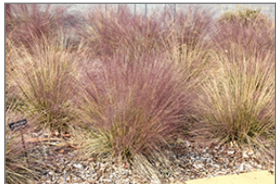
Hairawn Muhly in fall