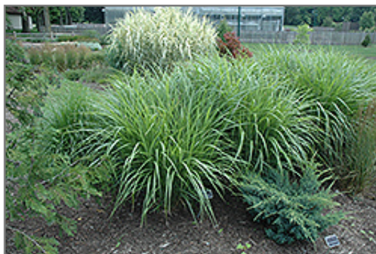
Silberfeder Maiden Grass