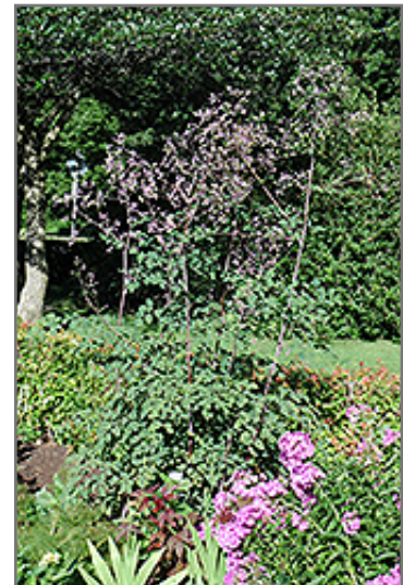
Rochebrun Meadow Rue in bloom