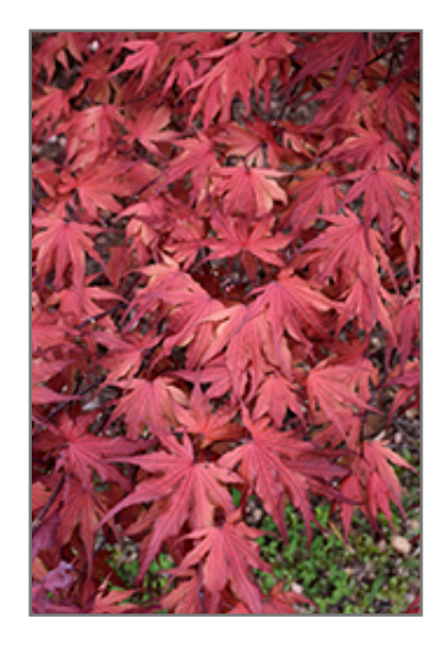
Purple Ghost Japanese Maple foliage

This is a relatively low maintenance tree, and should only be pruned in summer after the leaves have fully developed, as it may 'bleed' sap if pruned in late winter or early spring. It has no significant negative characteristics.