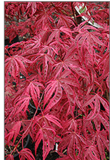
Shirazz Japanese Maple foliage