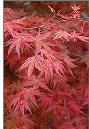
Suminagashi Japanese Maple foliage

This tree does best in full sun to partial shade. You may want to keep it away from hot, dry locations that receive direct afternoon sun or which get reflected sunlight, such as against the south side of a white wall. It prefers to grow in average to moist conditions, and shouldn't be allowed to dry out. It is not particular as to soil pH, but grows best in rich soils. It is somewhat tolerant of urban pollution, and will benefit from being planted in a relatively sheltered location. Consider applying a thick mulch around the root zone in winter to protect it in exposed locations or colder microclimates. This is a selected variety of a species not originally from North America.